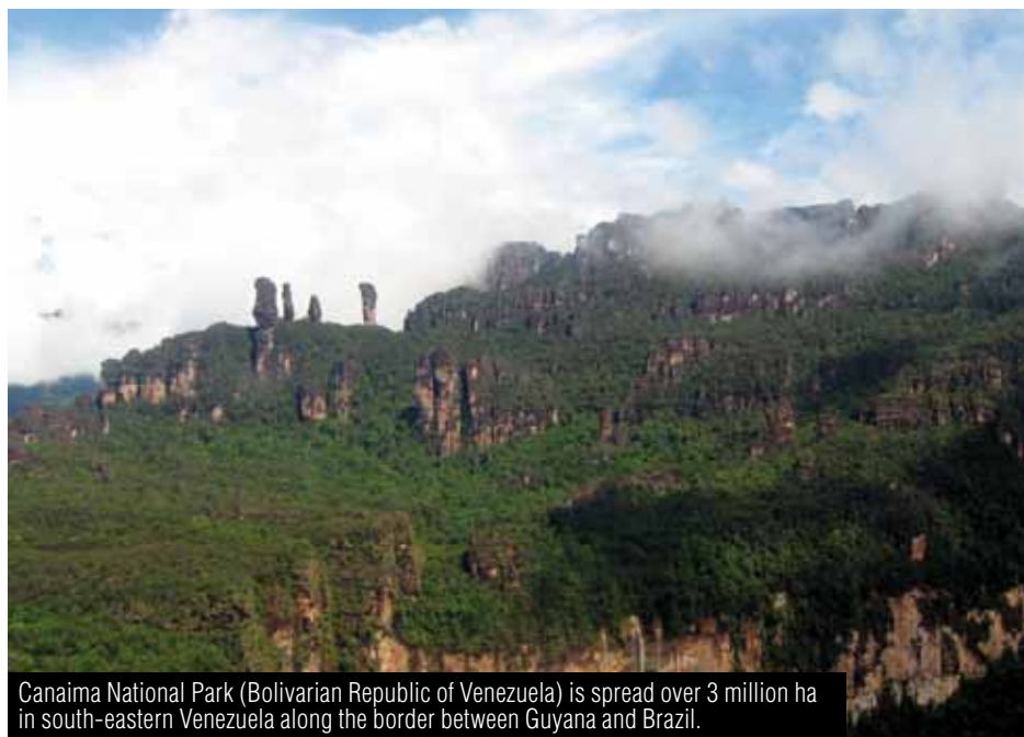
Canaima National Park (Bolivarian Republic of Venezuela) is spread over 3 million ha in south-eastern Venezuela along the border between Guyana and Brazil.