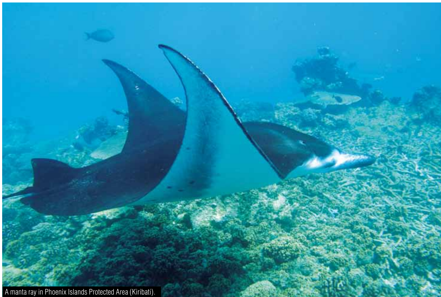
A manta ray in Phoenix Islands Protected Area (Kiribati).