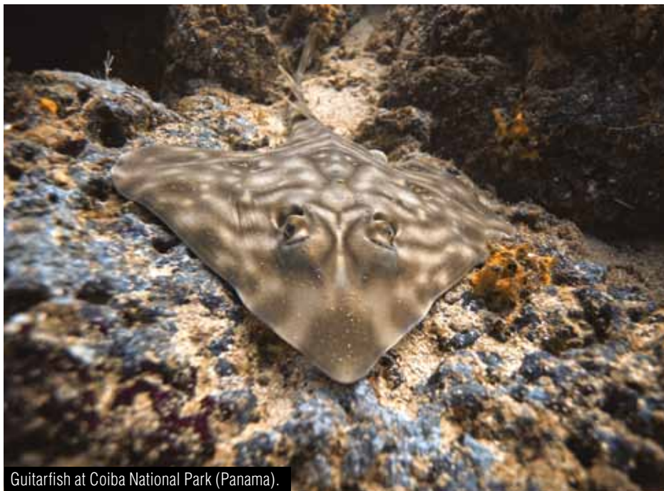
Guitarfish at Coiba National Park (Panama).