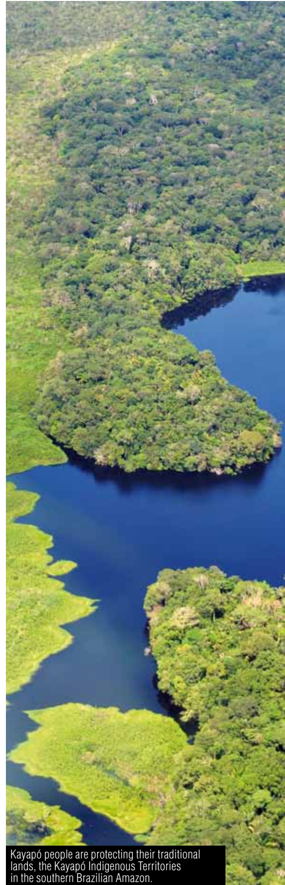
Kayapó people are protecting their traditional lands, the Kayapó Indigenous Territories in the southern Brazilian Amazon.

A third key point with respect to the Convention and wilderness conservation has to do with the added protection against industrial threats that the Convention can provide to existing and prospective wilderness World Heritage sites. The Convention was established in response to international concern that some of the most extraordinary places around the world were being destroyed or threatened with imminent destruction. The Convention requires sites to be well protected and managed and to demonstrate ‘integrity’. As