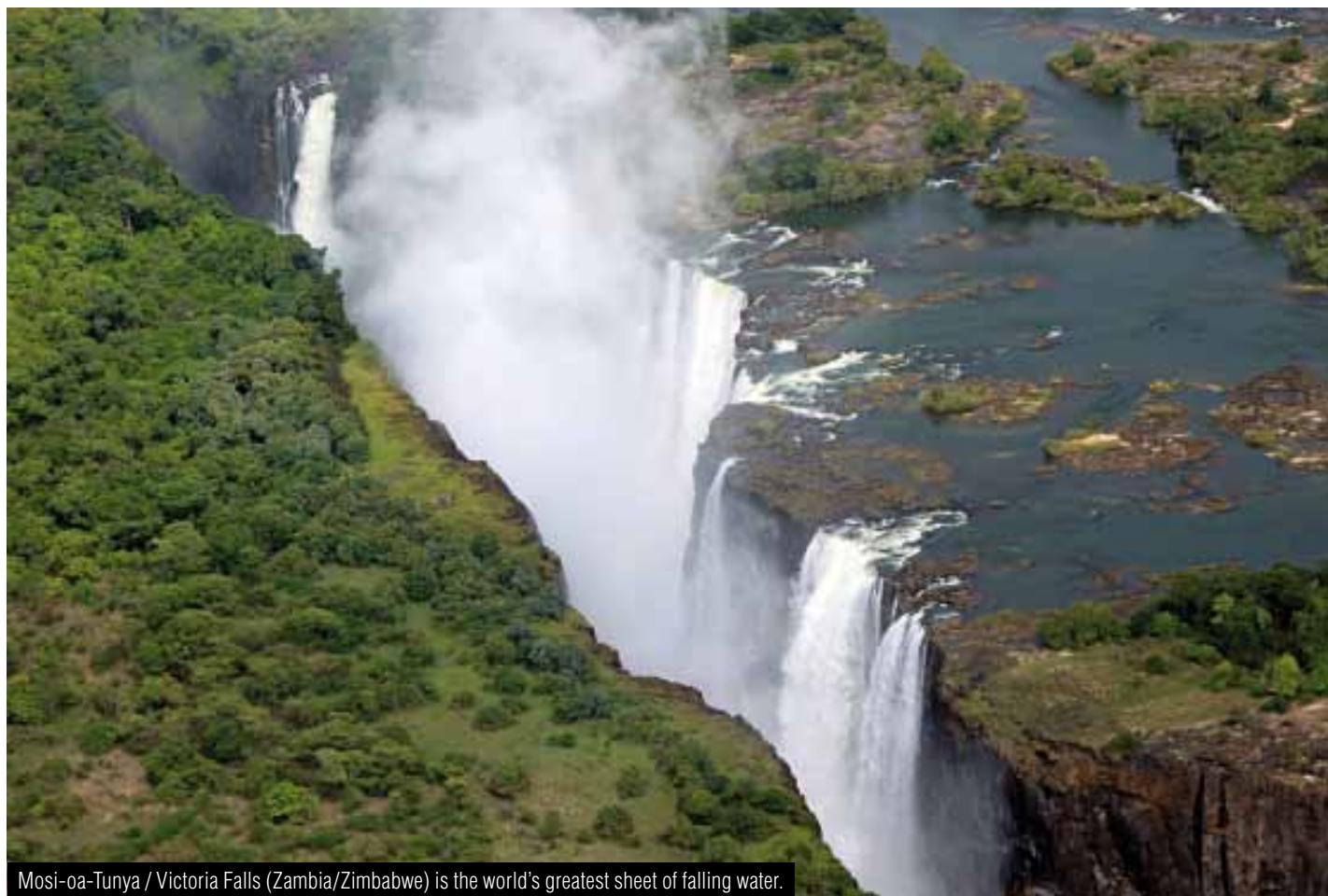
Mosi-oa-Tunya / Victoria Falls (Zambia/Zimbabwe) is the world's greatest sheet of falling water.